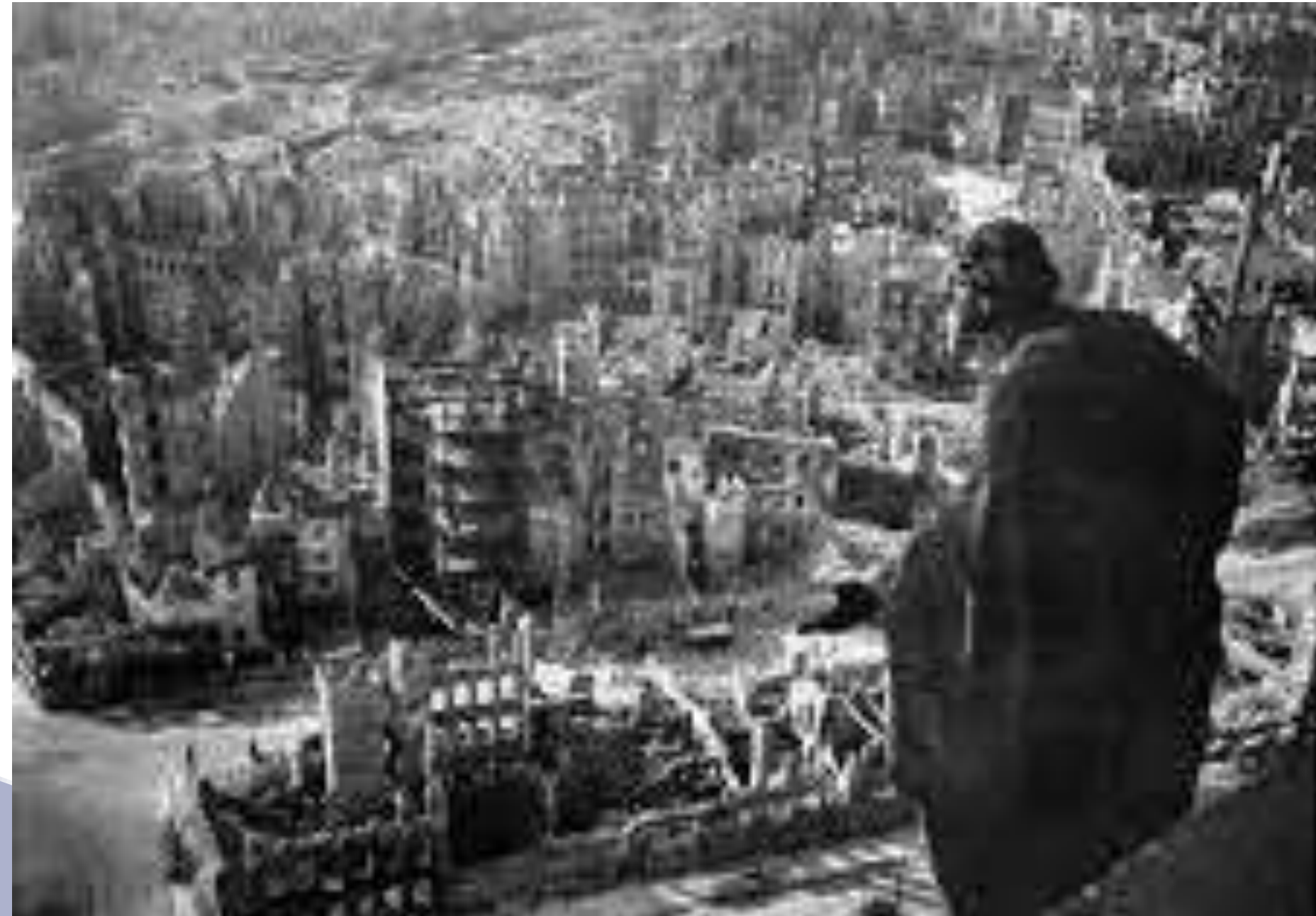
14 février 1954 – Dresde (Allemagne)

A story who beginning at the end of world war two