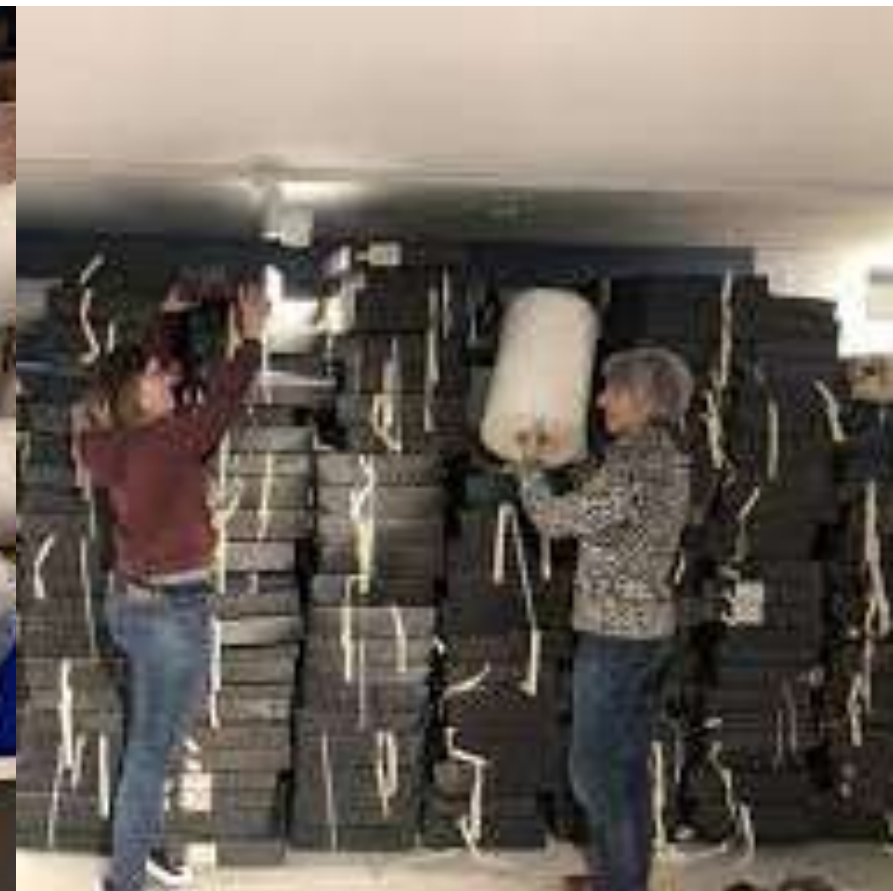
Matériel de protection envoyé en Ukraine pour la protection du patrimoine