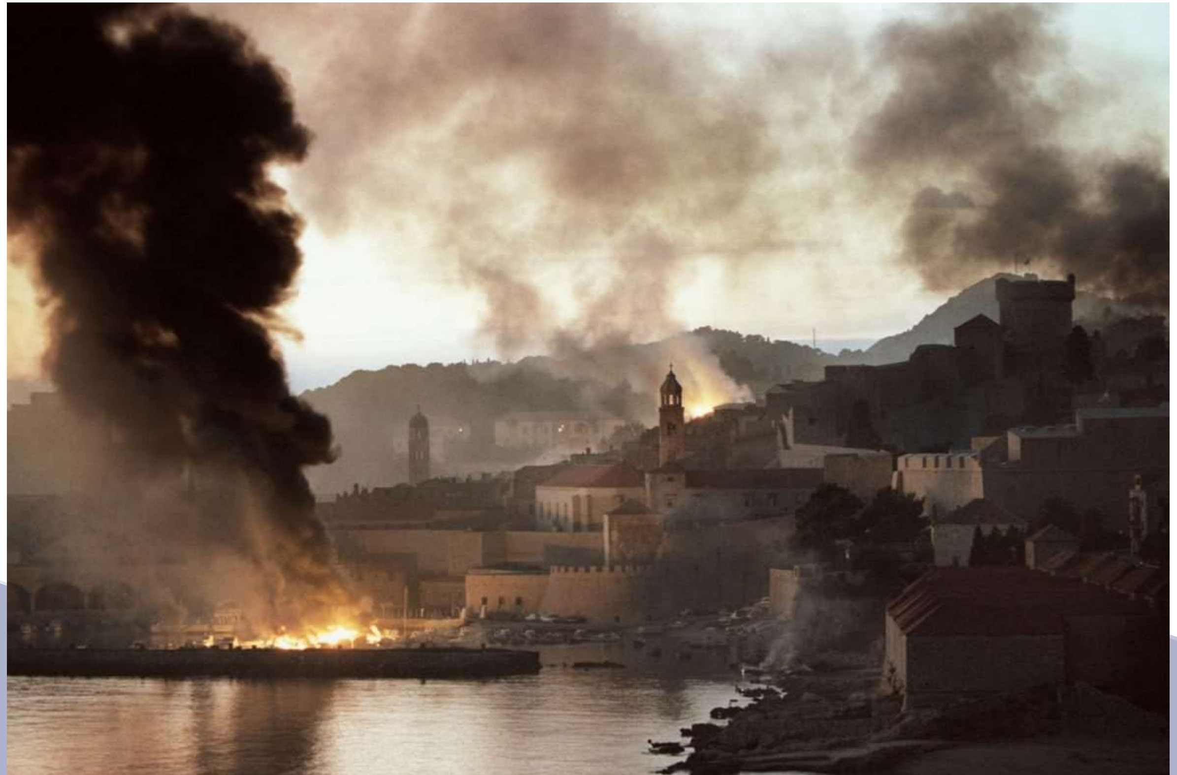
Bombardement de Dubrovnik (Croatie) – 1991-1992