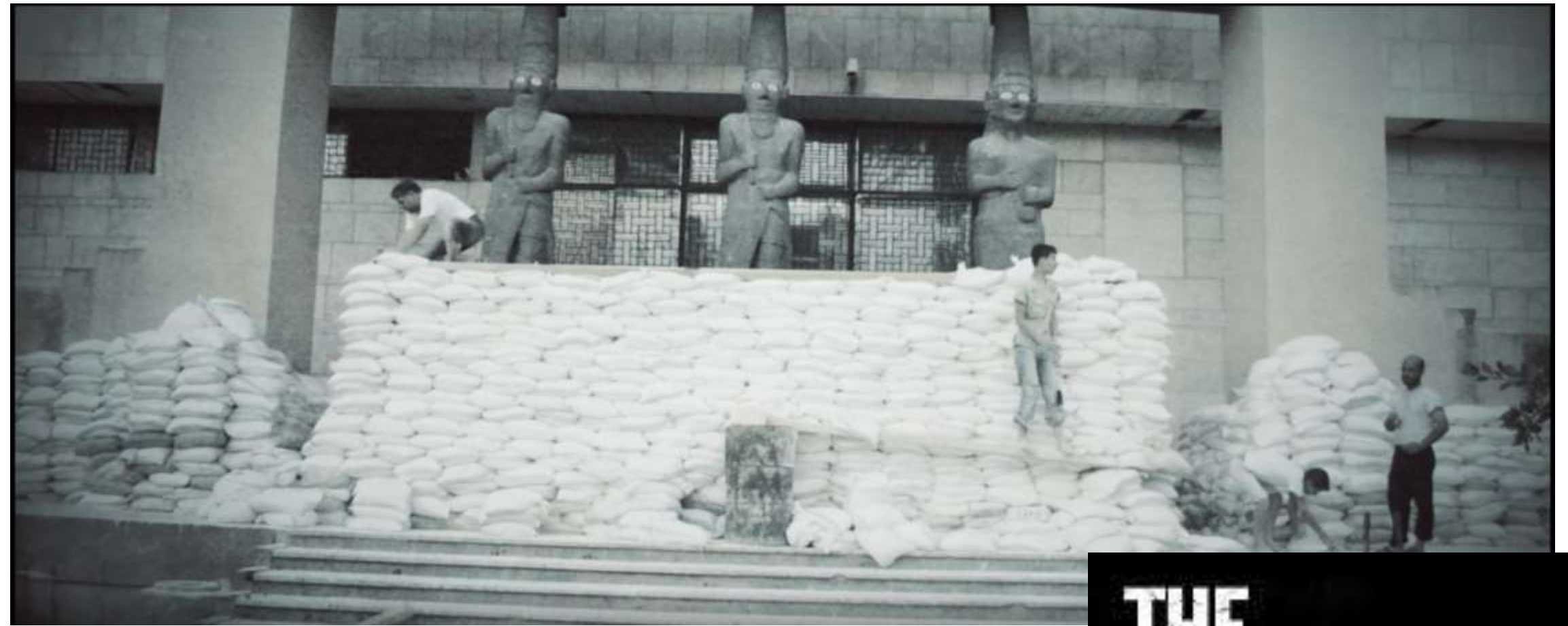
Alep museum protection, 2017